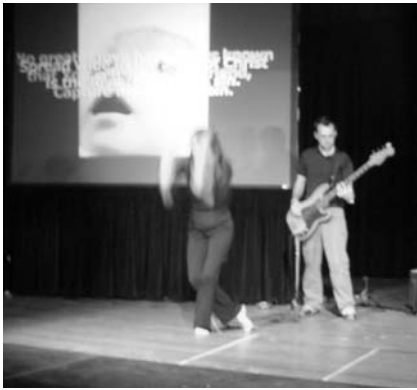
(Left) Expressing God's extravagant love

Our next Sabbath meeting is scheduled for Sunday, April 17, 2005. If you're in the area, make plans now to join us as we continue to celebrate God, life and each other with student ministries from across upstate South Carolina.