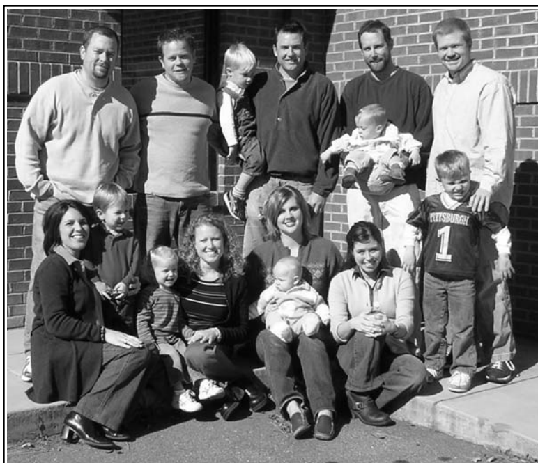
THE WAYFARER FAMILY